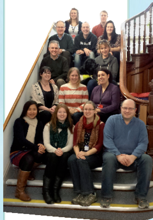
CHEME's new home Ardudwy ( below ) and CHEME research group inside their new building ( above )